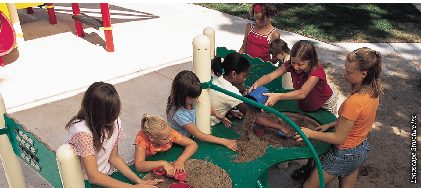
Landscape Structure Inc