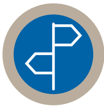
Wayfinding and signage