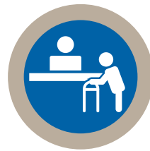
Interior services and environment