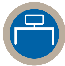
Additional use of space (if available in building)